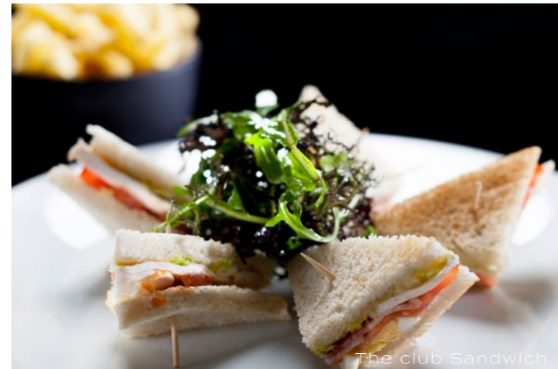
The club Sandwich