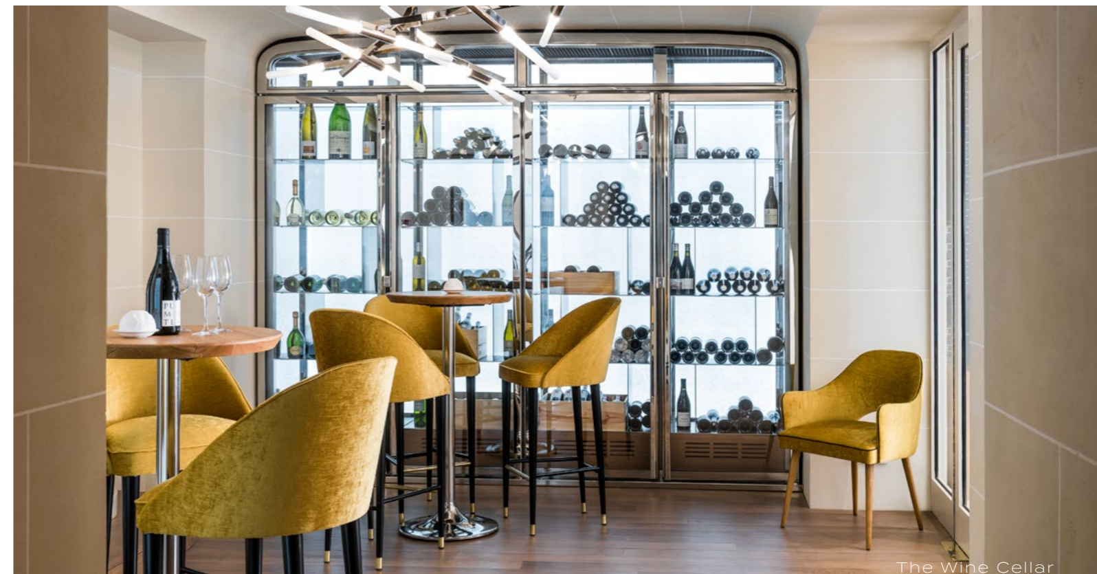
The Wine Cellar

On the wine menu, he offers a selection of the month, covering each of the wine regions of France: Champagne, Burgundy, Bordeaux, Alsace, Corsica (Calvi), the Rhône Valley, Provence, the Southwest, Jura. By the bottle or by the glass and always at attractive prices: Louis Roederer's superb 2009 Brut Premier for €19, Meursault Clos de la Barre 2013 for €23, Domaine Marquis d'Angerville's Pommard Premier Cru 2013 for €23 and Domaine Tempier's Bandol 2012 for €14. Such a selection is sure to refresh even the most discerning palate.