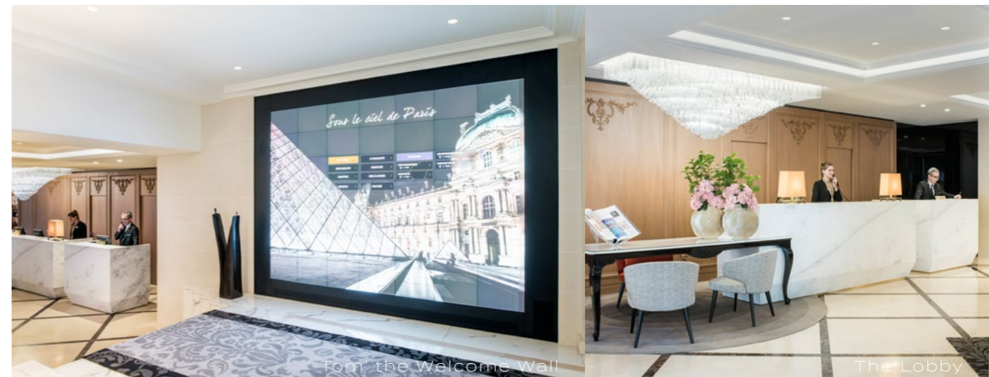
Tom, the Welcome Wall