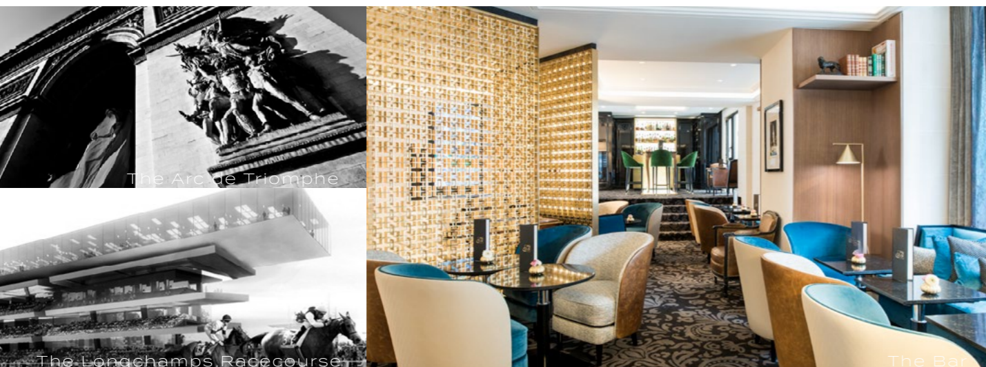
The Arc de Triomphe

And so, over the years the Baltimore has forged a reputation and a unique image that transcend borders. Embellished with wrought-iron balustrades and lined with balconies and windows abloom with red geraniums, the classic six-story Haussmannian façade exudes a truly unique architectural aesthetic, far from that of a typical luxury chain hotel. Thanks to its unique character, the Baltimore stands out in this exclusive neighbourhood in the heart of chic Paris.